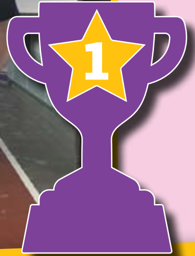
1st PLACE FRASER INGLIS SPORTS THERAPY STUDENT